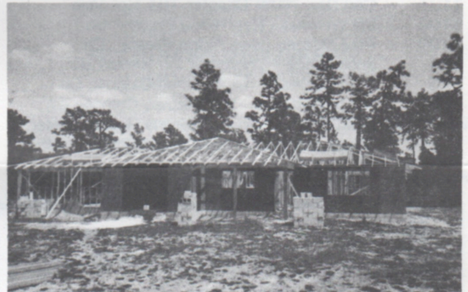
New Camp Rangers Home Now Under Construction near Gateway